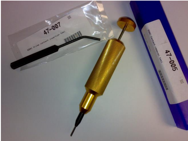
47-007 - EDAC Crimp contact insertion tool 47-005 - EDAC Contact removal tool

47-007 - EDAC Crimp contact insertion tool is a simple 'push fit' tool with a channel to accommodate the cable the contact is soldered/crimped on to.